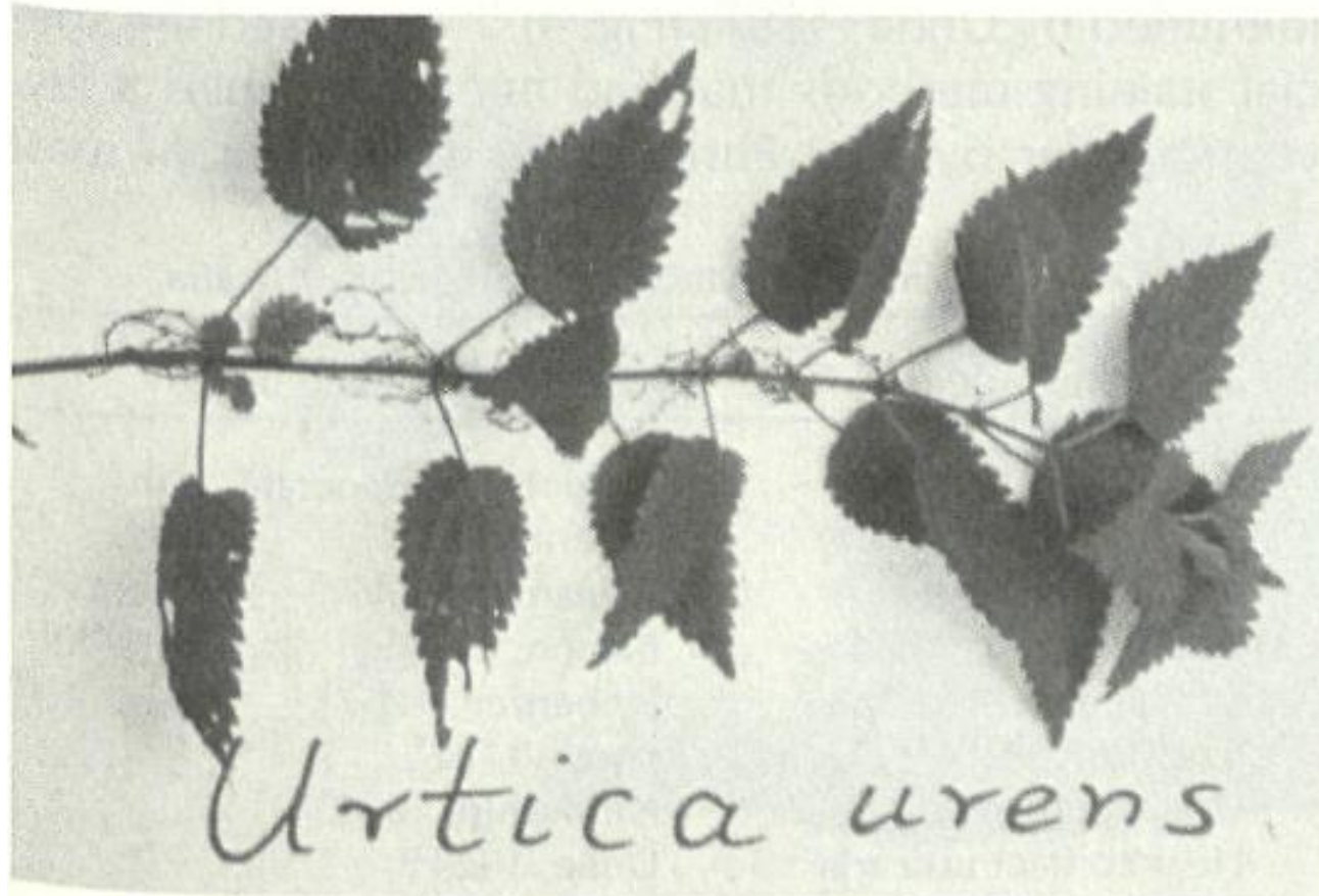
FIG. 1. Photograph of the nettle plant from which the name urticaria derives. The ability of the plant to cause whealing reactions on contact with skin was known already in antiquity. The reason for the elicitation of the wheal, namely, the injection of histamine and leukotrienes from the hairs of the nettle into the skin, has been known only since this century.